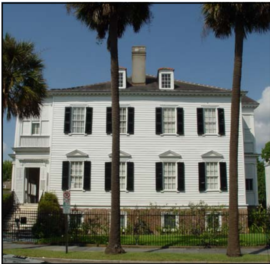
Above is an example of a Southern town and country home. During the hot, muggy summers, plantation owners and their families would leave the plantation for their townhouse. This house is located on South Battery St. in the White Point area of Charleston, SC.

A favorite site for Ozbourn shipmates and wives is the old Market Place where visitors could purchase baskets and jewelry made by local artists. Everyone enjoyed lunch at several nearby restaurants.