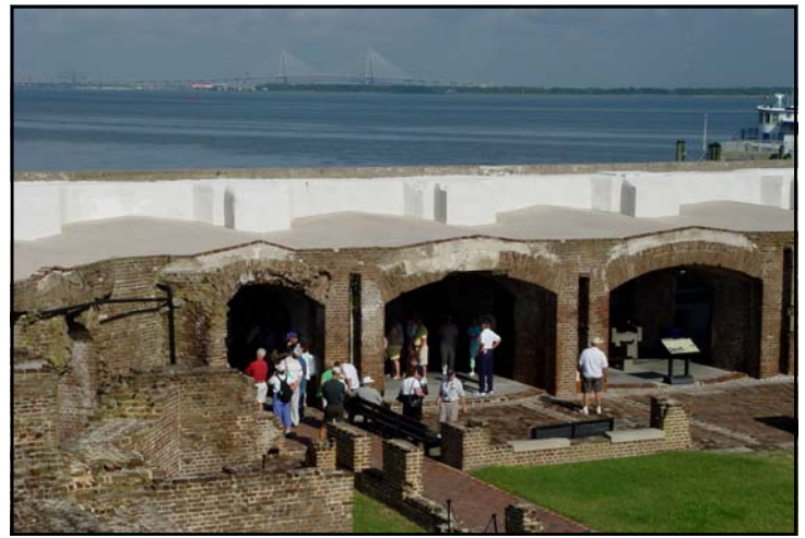
Ozbourn salts and wives gather around National Park Service naturalist (not shown) to get a history lesson about Fort Sumter, South Carolina. Charleston is off on the horizon.