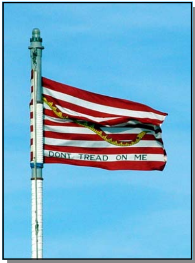
DON'T TREAD ON ME

The new Union Jack was adopted after the 9/11 Attack on America.