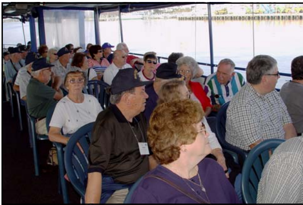
Shipmates & spouses look forward to visiting Fort Sumter.