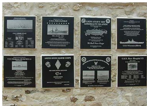
Close-up of commemorative plaque grouping

The committee will have the final draft ready for presentation to the membership at the business meeting to be held during the reunion next year in Charleston.