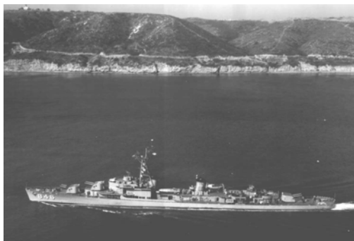
Haze Gray and Underway!