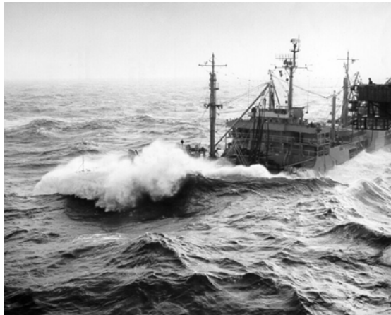
Underway replenishing operations

Upon arrival in Sasebo I moved to the BOQ and had my first experience ashore in postwar Japan. The XO of the Prairie invited me back aboard for lunch and dinner a couple of times which was very thoughtful of him. "Messing" in the BOQ was not too good.