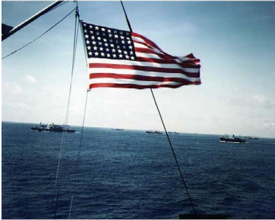
The Stars and Stripes Forever