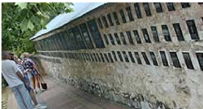
Memorial Wall at the Nimitz museum, Fredericksburg, TX

At the last reunion during the tour of the Admiral Nimitz Pacific War Museum in Fredericksburg, TX we viewed the Memorial Wall where many commemorative plaques are on display on a 100 year old limestone wall. Individuals, ships, or units from any of the United States or Allied military branches of service that served in the Pacific during WWII may be honored in this manner. Plaques are solid metal, photo-chemically etched and anodized with a dark bronze