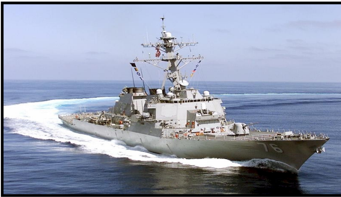
USS HIGGINS DDG-76

Our first encounter was with the USS Higgins, DDG-76, an Arleigh Burke Class Guided Missile Destroyer assigned to Desron-15, based in Manila, Philippines. The second encounter was with the USS Savannah, LCS-28, a Littoral Combat Ship, docked in Puerto Princessa, Philippines. Seeing our Navy as we travel the globe is truly heart warming and makes us extremely proud. (Editors Note: All Shipmates are encouraged to submit stories and photos of their experiences while traveling the globe.)