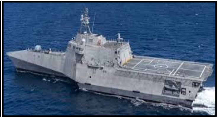
USS SAVANNAH LCS-28